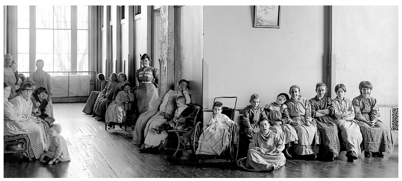
Women and children of the St. Louis Poor House (1904), St. Louis, Missouri

Lantern for Lost Voices was founded by four individuals dedicated to amplifying the voices of the community. We are a nonprofit organization founded on the idea that all voices matter, and that carries into our team as well. Each member is a respected and valued part of our team. In 2024, we have added an additional staff person, several volunteers, and our first intern!