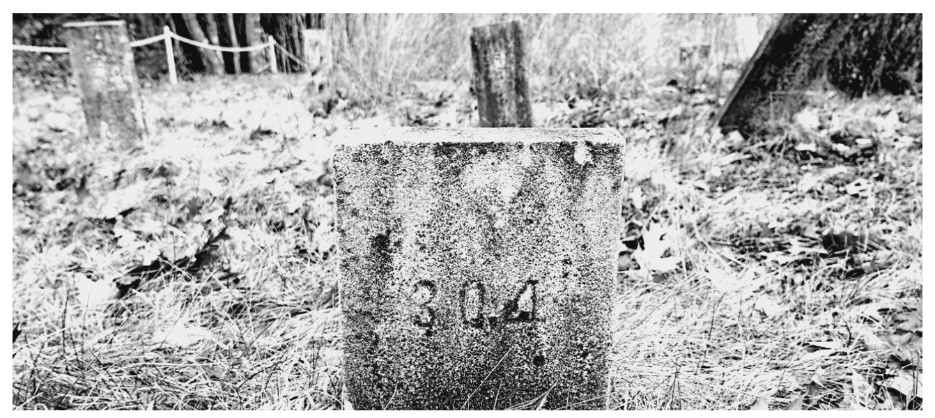
Pine Grove Cemetery/Hillsborough County Poor Farm Cemetery, Goffstown, Hillsborough County, New Hampshire.